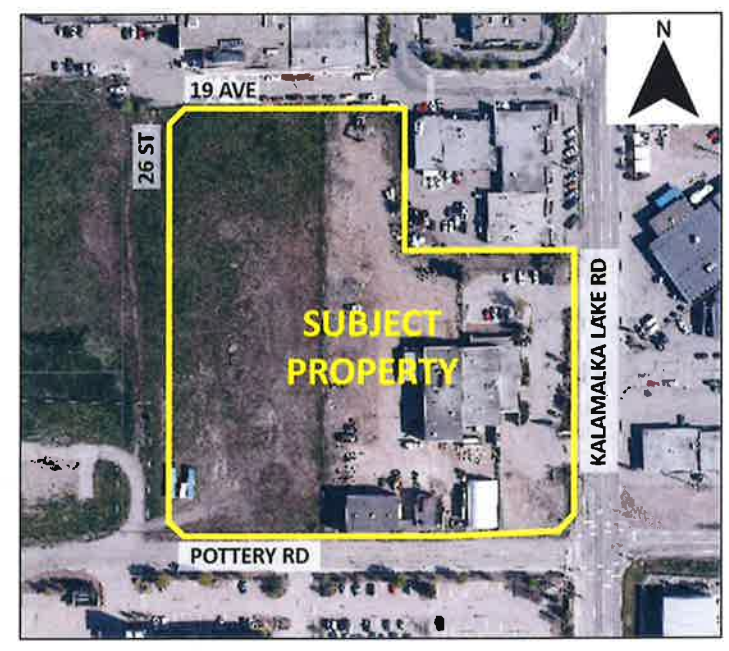
Figure 2 - Aerial Photo of Property

in the proposed liquor service areas until 10:00pm daily when meal service is available. An off-premises sales endorsement would allow the licensee to sell the brewery's products from the service bar.