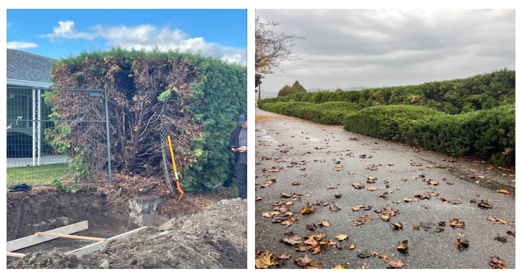
Showing the interior of cedars