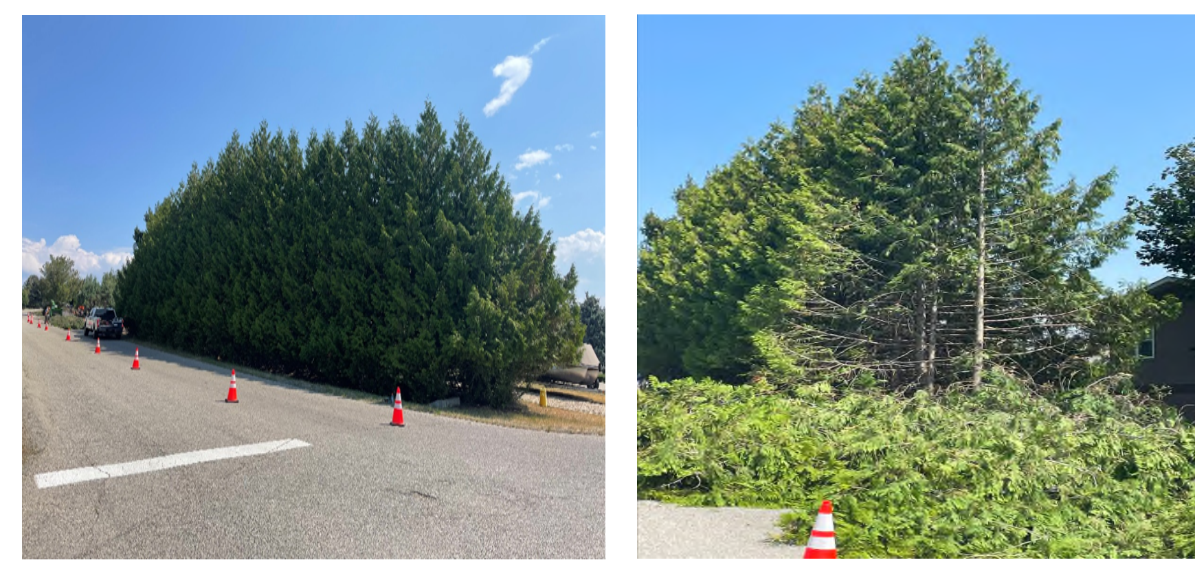
Row of cedars -before picture