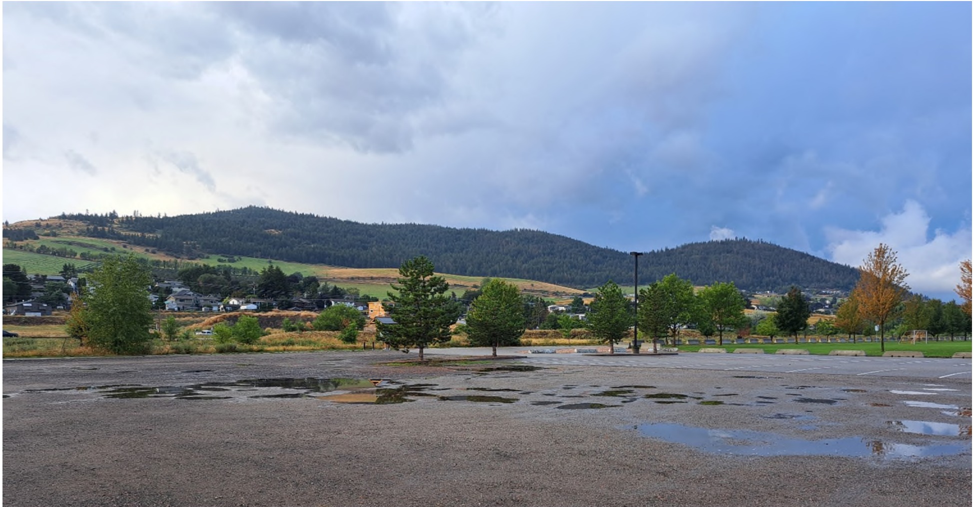
Parking lot potholes. Photo: August 27, 2024