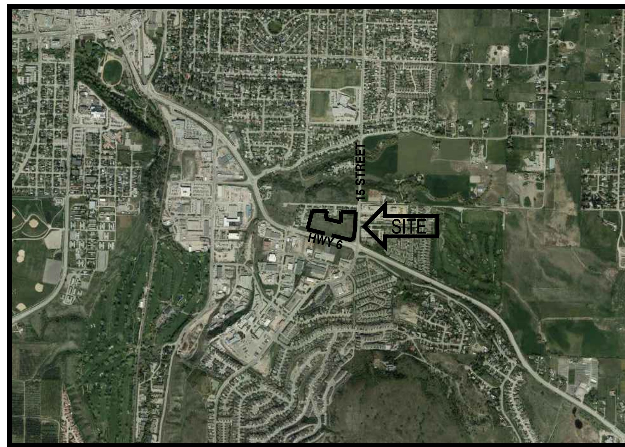
KEY PLAN SCALE: 1/4" = 1'-0"

GENERAL NOTE: BOUNDARIES SHOWN HEREON ARE DERIVED FROM EXISTING RECORDS AND MUST BE CONFIRMED BY SURVEY PRIOR TO THE DETERMINATION OF DIMENSIONS OR AREAS FOR DEVELOPMENT PURPOSES.