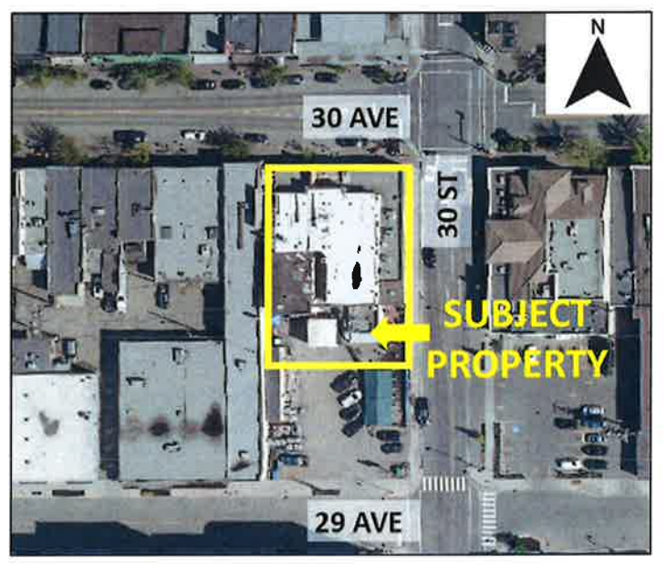
Figure 2 - Aerial Photo of Property

required. There are many public parking options in the City's downtown core, including street parking, parking lots, a parkade and ten-minute pick-up/drop-off zones.