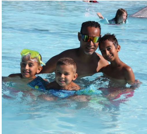
Swimmers enjoying the sunshine at the Lakeview Pool at our Grand Opening Event.