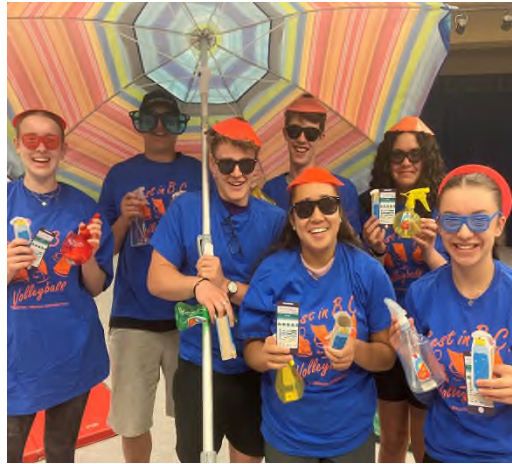
Summer Camp Staff – Staff Training Day