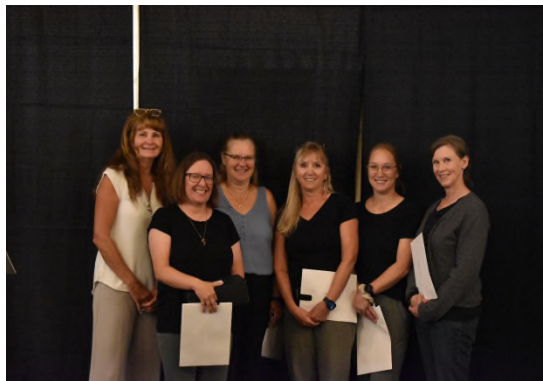
Administration team being recognized with a corporate award for the successful rollout of the two tier system

1,934 Vernon Resident Passes issued to residents and participating communities