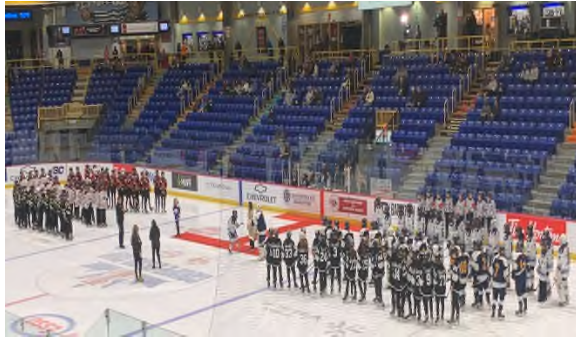
Opening ceremonies of the 2024 Esso Cup – U18 Female National Championships