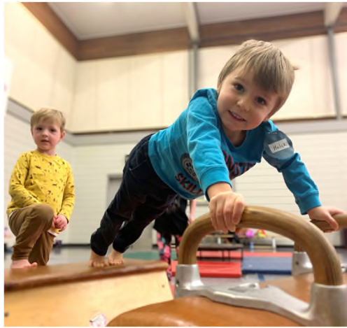
Kidnastics Class in the Dogwood Gym