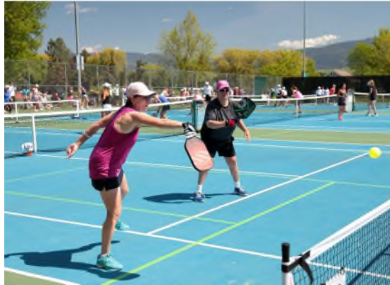
Pickleball at Marshall Tennis Courts