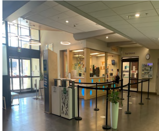
Registration desk at the Recreation Centre