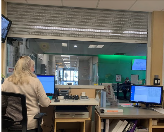
Registration Desk at the Vernon Recreation Centre

20% of drop-in admissions are non-resident