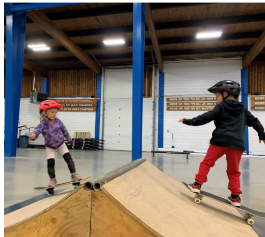
Skateboard Lessons – Curling Rink