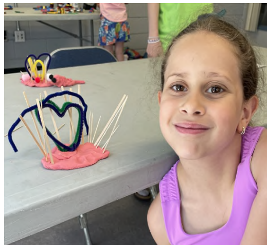
Activity in the Auditorium