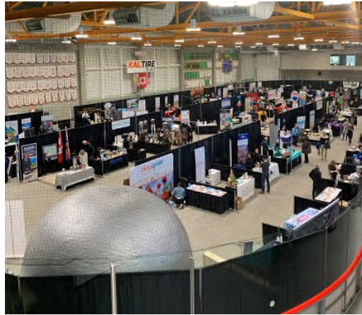
Vernon Chamber Spring Community Expo at Kal Tire Place North