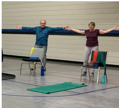
Fit ABC's Class in the Dogwood Gym