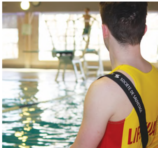
Lifeguard on duty at the Vernon Aquatic Centre.