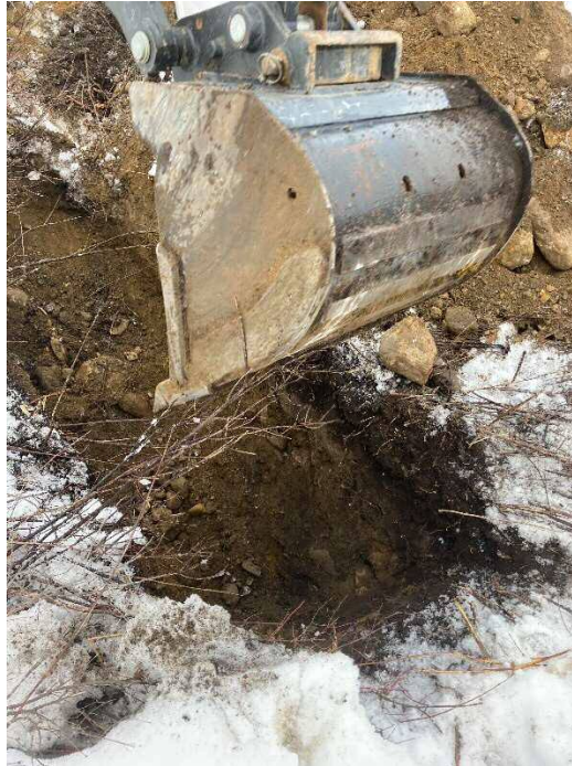
Site Photo 3 – TP3