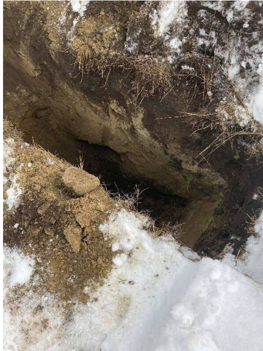
Site Photo 4 – TP4