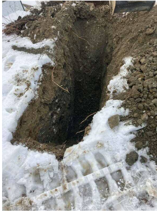
Site Photo 2 – TP2