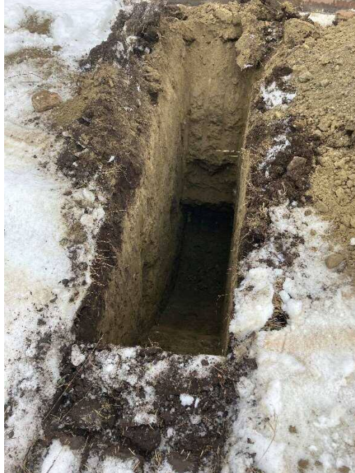
Site Photo 1 – TP1