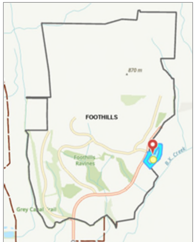
Figure 1 – Location of Subject Property

With the property being adjacent to the Foothills Neighborhood Plan Area, along with the transportation network and the urgency of meeting the need for multi-family housing, Administration supports increased density on this parcel.