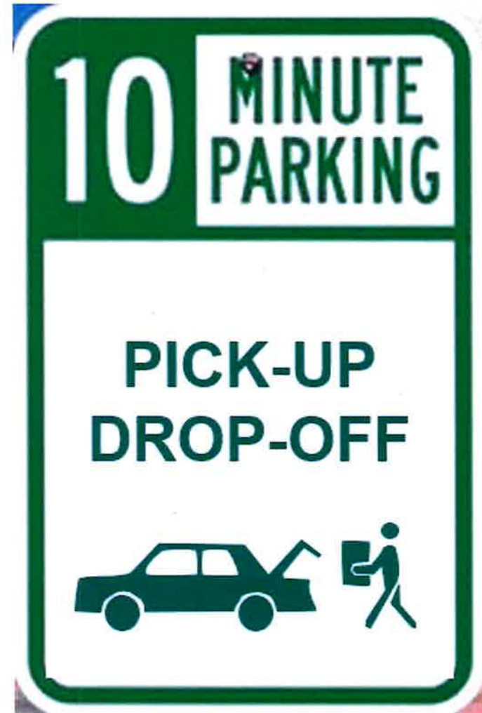
Mock-up of proposed, permanent signage