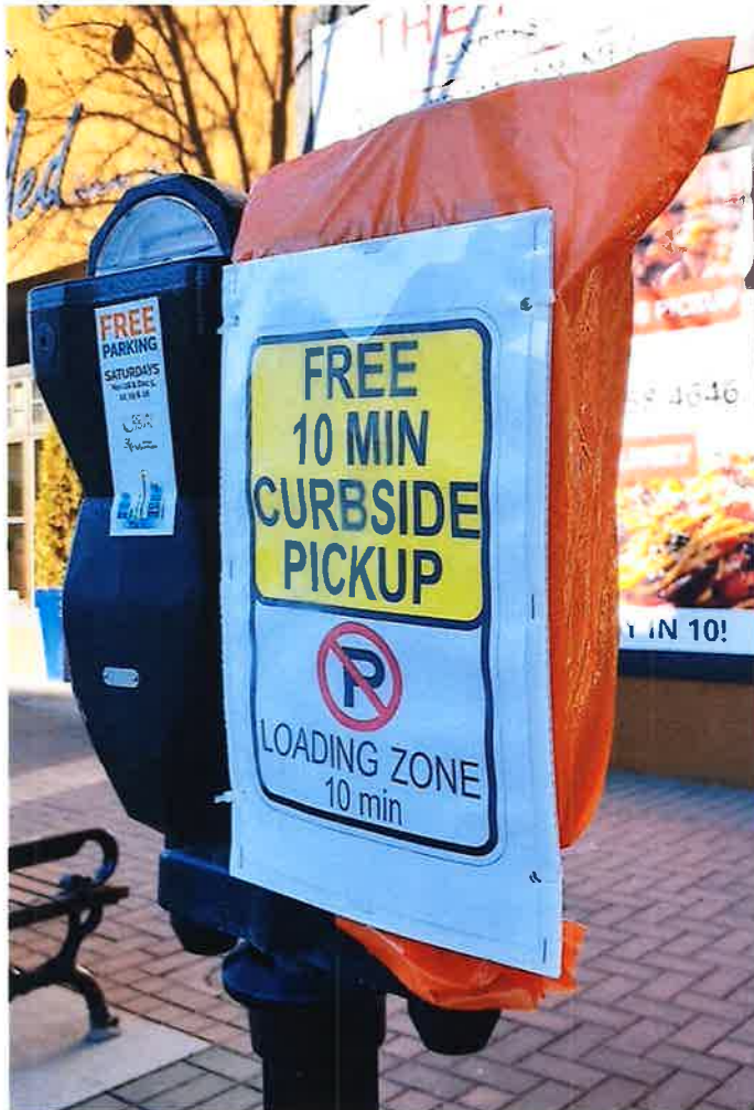
Current, temporary signage