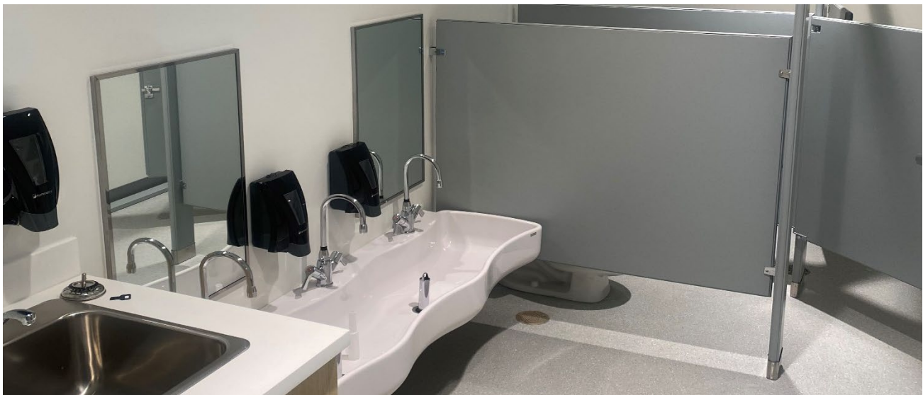
Infant toddler bathroom