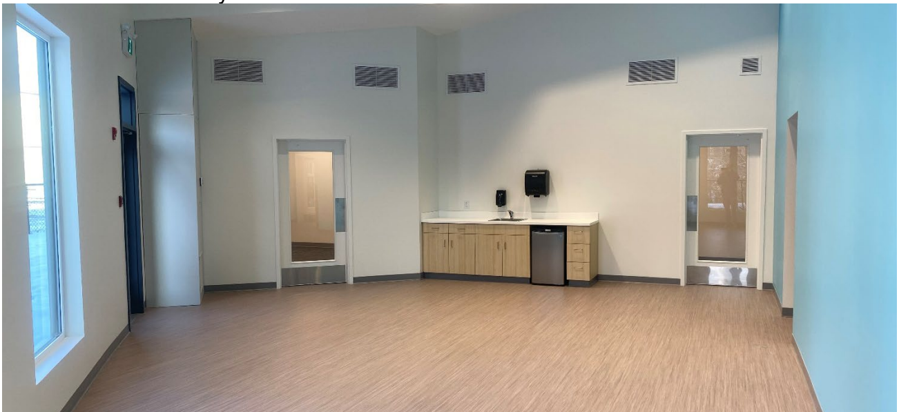
An infant toddler room and showing the two nap rooms