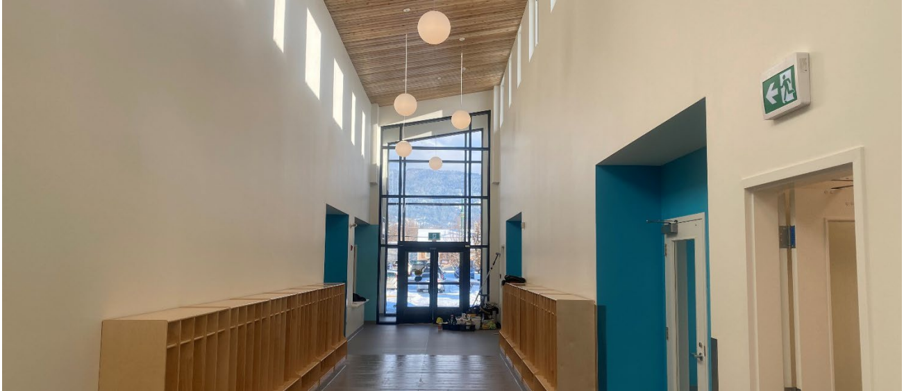
Entrance hall of the Recreation Complex Child Care.