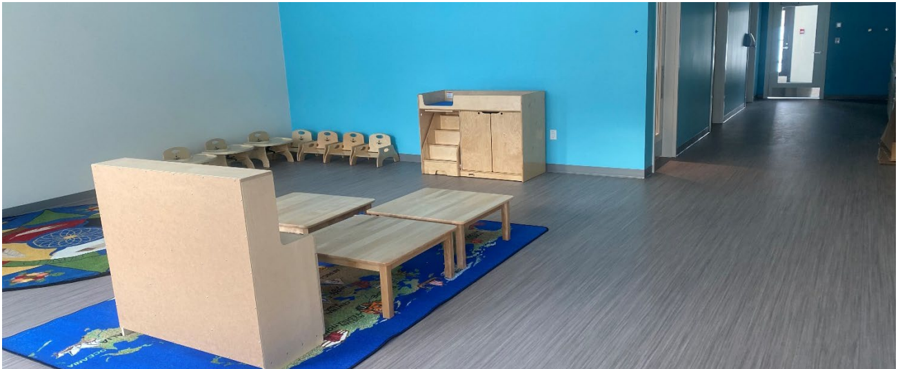
A finished classroom