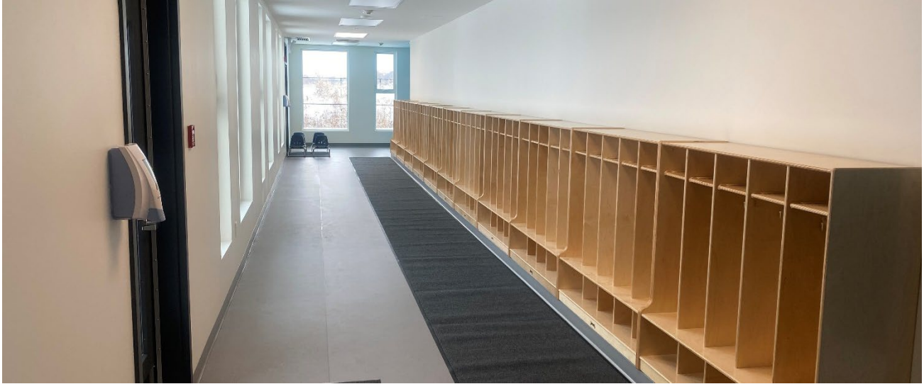
Lakers Child Care main hallway