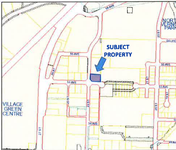
Figure 1 - Location of Subject Properties