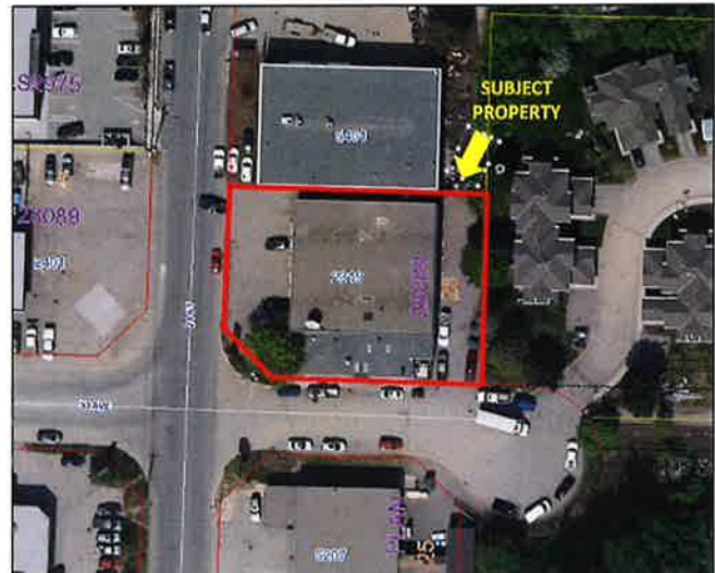
Figure 2 - Aerial View of Subject Properties