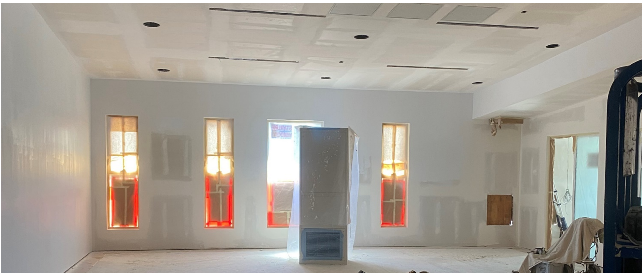
A 3-5 class room being prepped for painting.