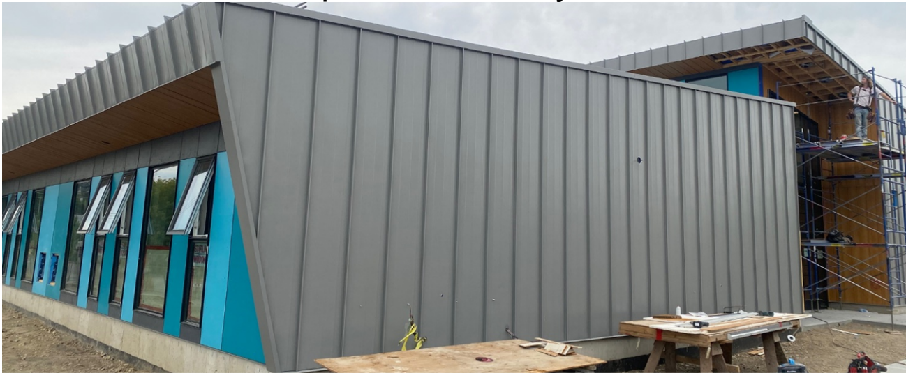
The last section of siding being installed at the entrance to Rec Complex Child Care.