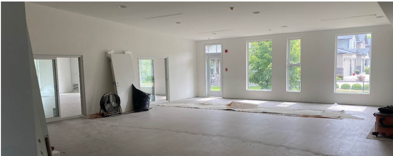
A Class room with flooring installed and final finishing's being completed.