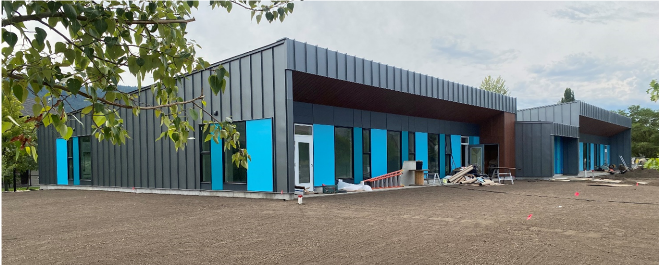
Landscaping has started, with irrigation lines in place and trees planted.