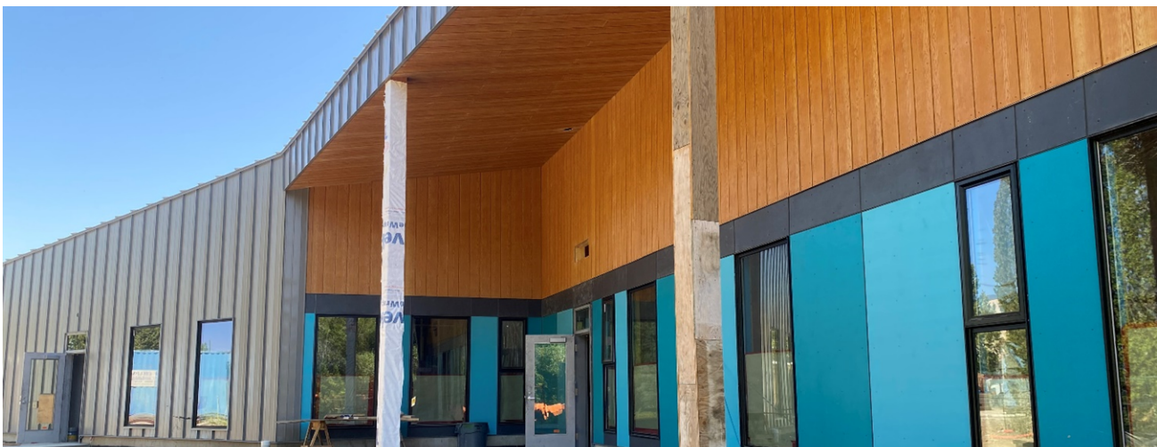
The outdoor covered play area, support beams are being wrapped for final finish.