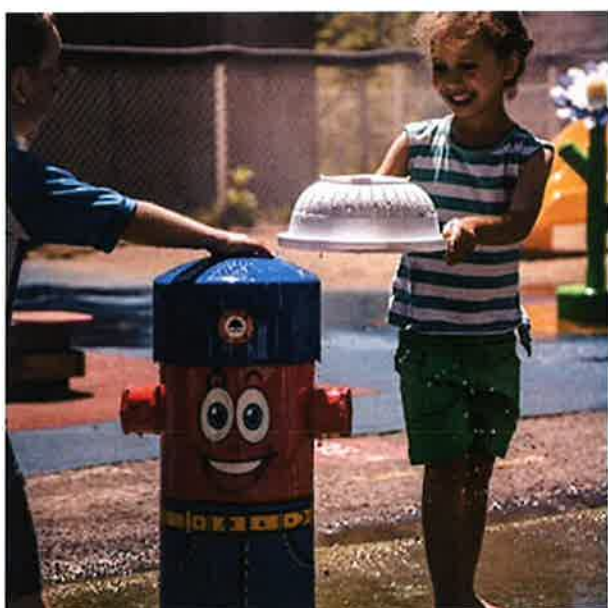
O'GUS THE FIREFIGHTER