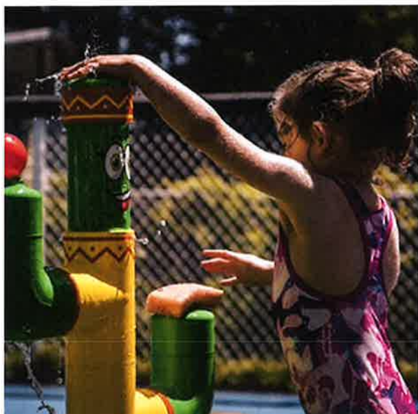
PICTUS THE CACTUS