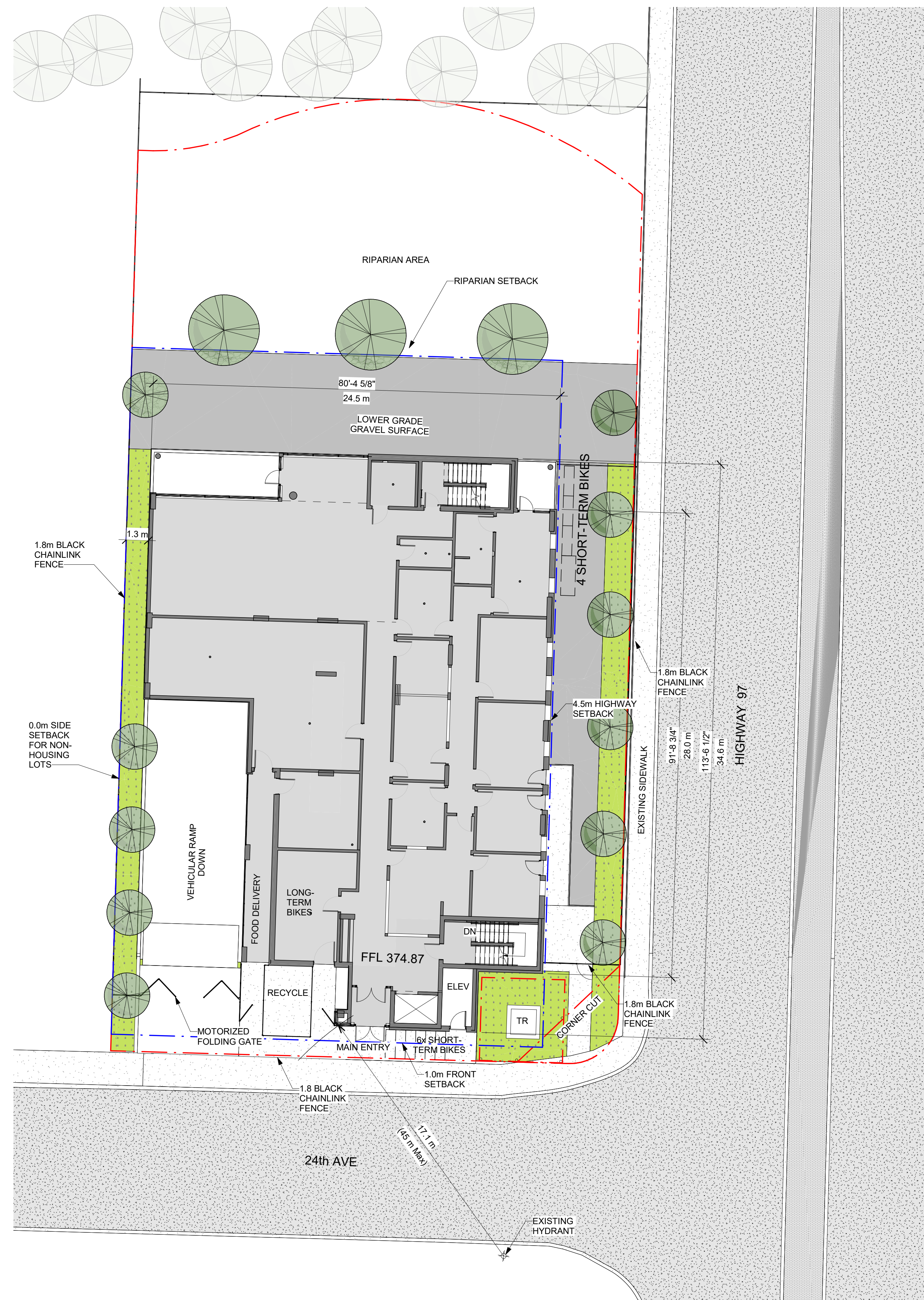
1 SITE PLAN 1:150

101 - 1440 ST PAUL STREET, KELOWNA, BC, V1Y 2E5 WWW.TENGRIC.A THIS DRAWING MUST NOT BE SCALED • VERIFY ALL DIMENSIONS AND DATES PRIOR TO COMMENCEMENT OF WORK • REPORT ALL ERRORS AND OMISSIONS TO THE ARCHITECT • VARIATIONS AND MODIFICATIONS ARE NOT ALLOWED WITHOUT WRITTEN PERMISSION FROM THE ARCHITECT • THIS DRAWING IS THE EXCLUSIVE PROPERTY OF THE ARCHITECT • ANY REPRODUCTION MUST BEAR THEIR NAME AS ARCHITECT • REPORT ANY ALL CONFLICTING INSTRUCTIONS TO THE ARCHITECT PRIOR TO PROCEEDING WITH CONSTRUCTION